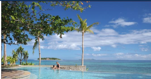
3 Pool swimming complex