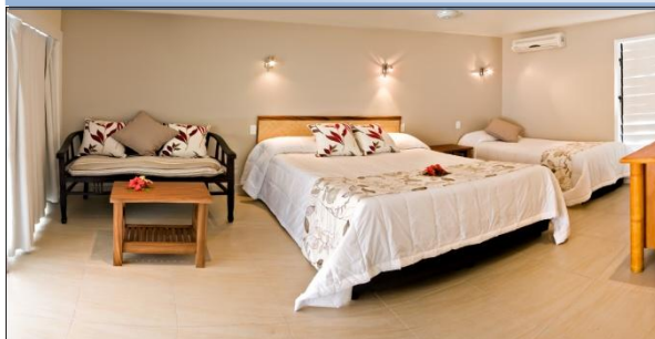
Ocean view & Beachfront bures