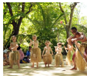
Our little Treasure's