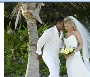
For weddings & romantic escapes